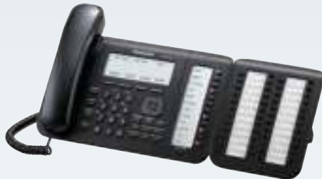
Photo: KX-NT556 with KX-NT505